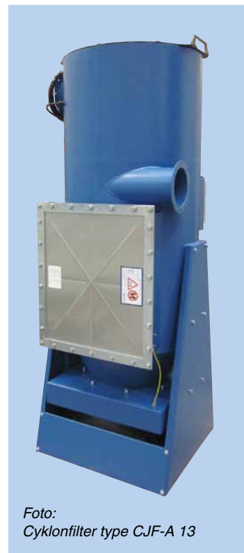
Foto: Cyklonfilter type CJF-A 13

At installation of units with relief membrane you must be aware of the heavy pressure wave and the flame spread that will occur in areas outside of the relief membrane and mount the unit so that the explosion is led away from people and building components.